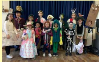
St Michael's, Woolmer Green