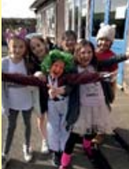
St Mary's, Rickmansworth