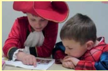
St Mary's, North Mymms